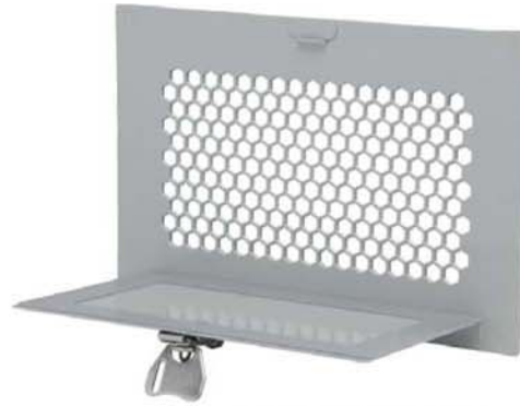
Platinum Series CAP-CT-12 shown, with cover open

The larger rectangular viewing area provides an unparalleled field of view when compared to traditional round IR windows.