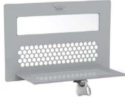
CAP-VCH-12 shown, with cover open