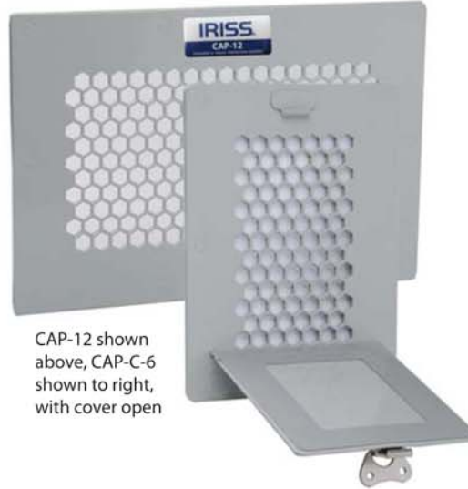
CAP-12 shown above, CAP-C-6 shown to right, with cover open

Available in 6", 12", and 24" widths, CAP Series IR windows allow inspection of multiple components through one window, reducing the total number of windows, associated installation time, and costs.